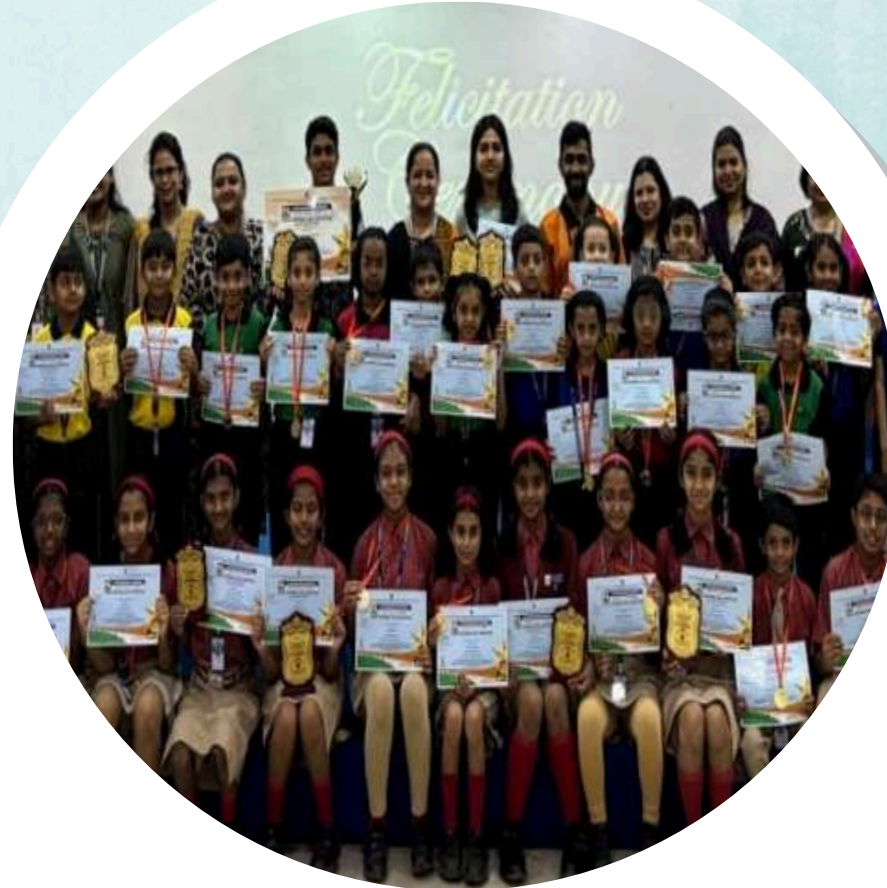
All India Art Competition