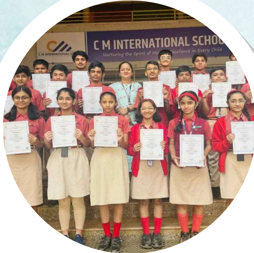
Elementary & Intermediate