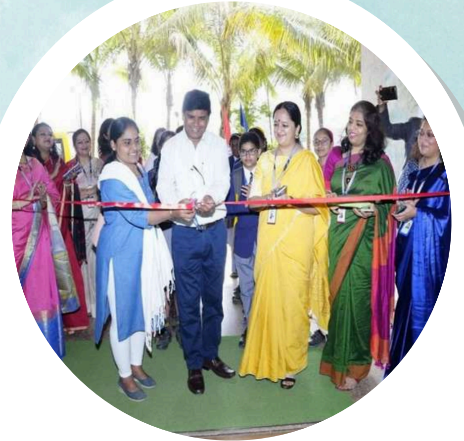
Ektvam Interschool Competition