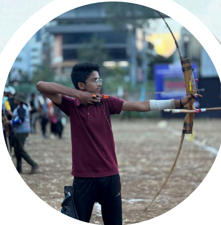
CBSE South Zone II Archery Championship